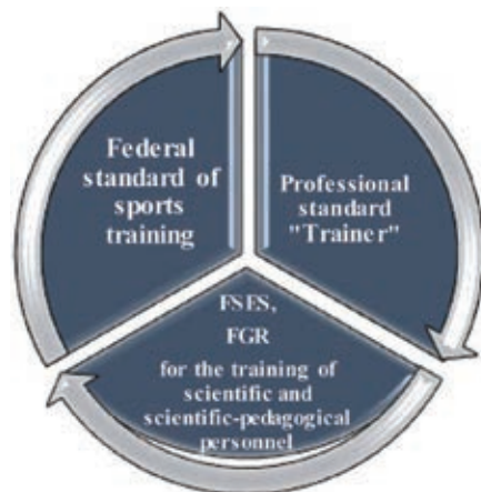
Figure 2. Logical diagram of the relationship of documents regulating educational, scientific and sports activities in the field of physical culture and sports

The content of the main professional educational programs aimed at training personnel for the field of physical culture and sports, first of all, takes into account the Federal State Sports Training Standards, which should be developed by specialists in a particular sports discipline and based on scientific evidence. Only such a document can be effectively implemented in organizations that train the sports reserve. The professional standard of a sports coach takes into account the Federal Standard for Sports Training and all the scientific knowledge that underlies its development. The Federal State Educational Standard (FSES) and the Federal State Requirements (FGR) regulate the design of basic professional educational programs, taking into account the requirements of the Federal State Standards for Sports Training and professional standards for sports and scientific personnel who ensure the development of documents and the implementation of professional activities in each subsequent cycle.